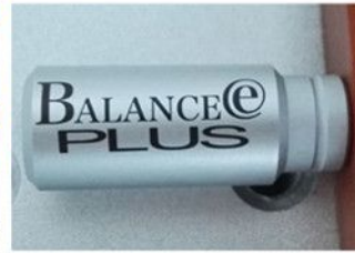
Aluminum black marking