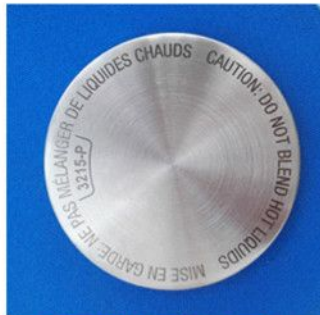
Metal black marking